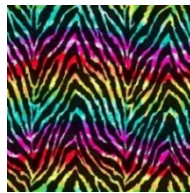
Fig.7 Unnatural Color