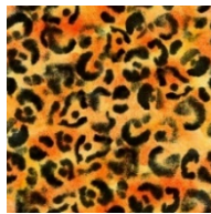
Fig.6 L Color