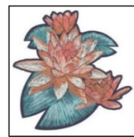
Fig.8 Imitation Embroidery Texture