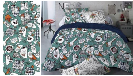
(a) Main pattern (b) Bedding effect chart