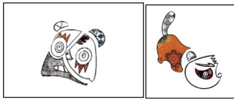
(a) Local exaggeration (b) Split combination